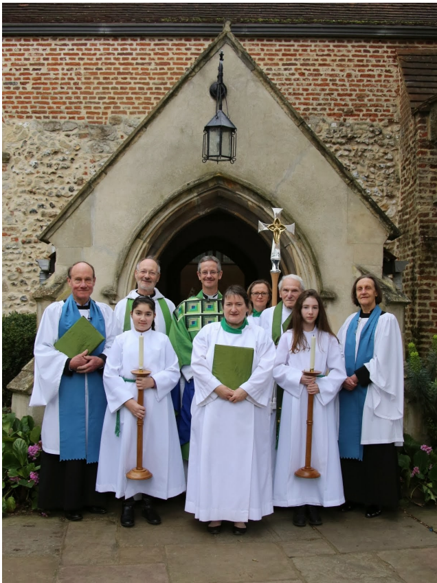
The St Mary's Team with our guests for the Rehallowing Service