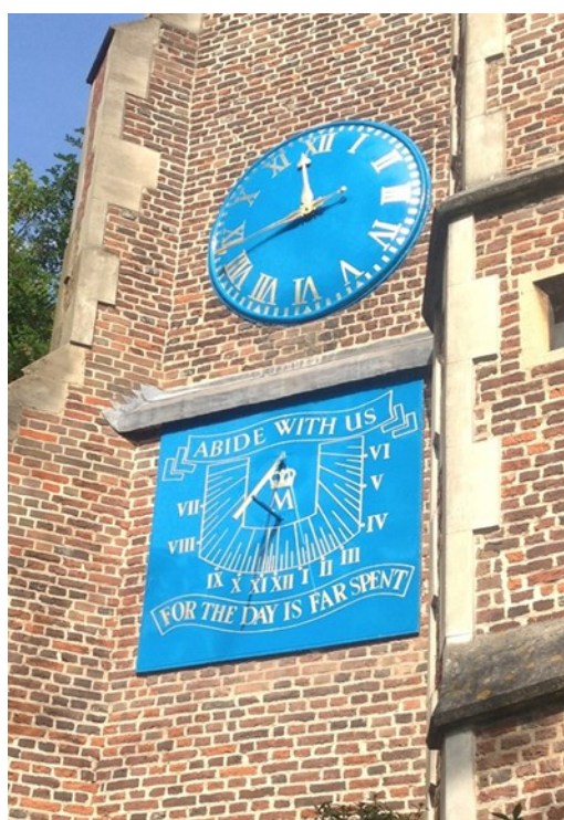
The newly refurbished clock and sundial on St Mary's Tower

Email: judygowing@blueyonder.co.uk Tel: 020 8741 5083