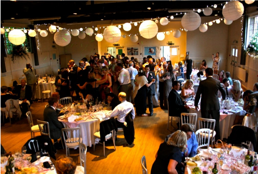
A wedding reception in Kitson Hall