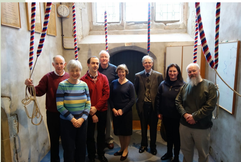
Bellringers in the Tower