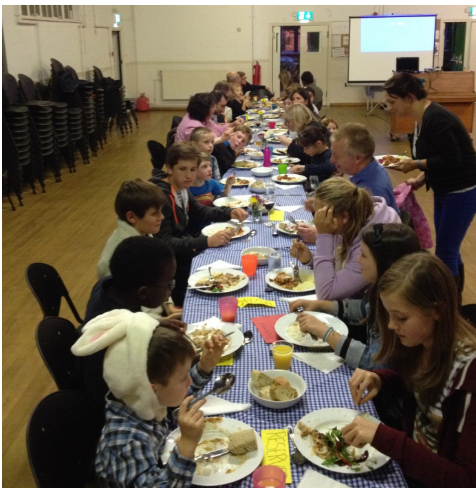
Sunday Club members at the Harvest Supper 2013