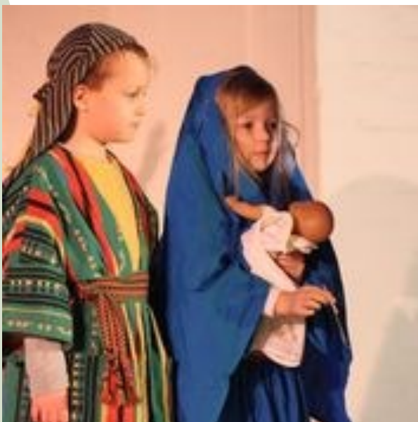
The Nativity at St Mary Barnes 2013