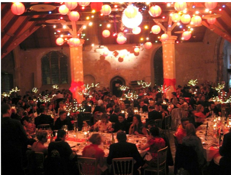
Guests enjoying the Barnes Charity Ball Tales of the Orient at St Mary's in February 2013