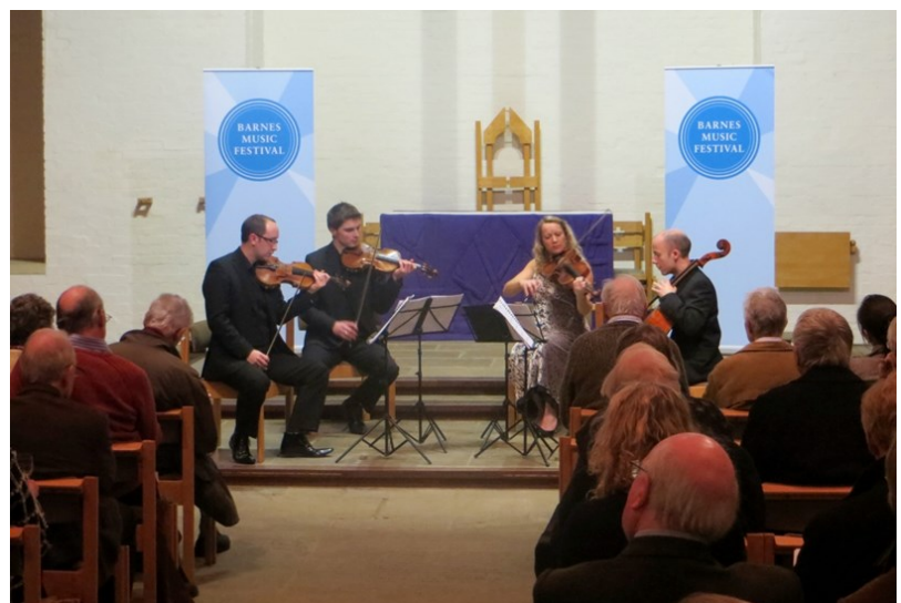
Villiers String Quartet playing at the Barnes Music Festival 2013