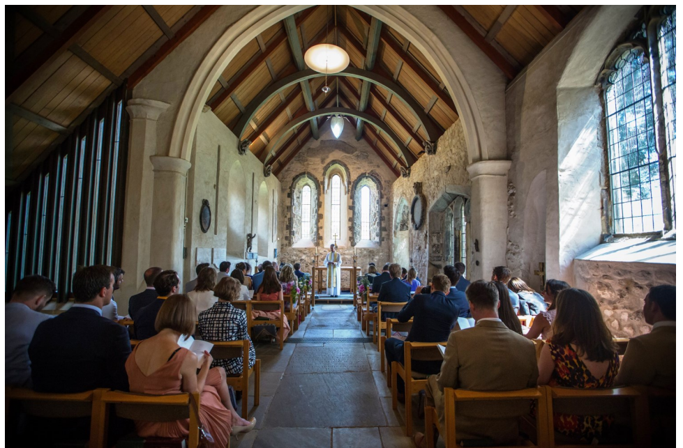
The Langton Chapel during a wedding