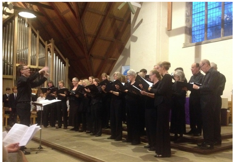
Barnes Music Festival Chorus sing the world première of David Bednall's anthem