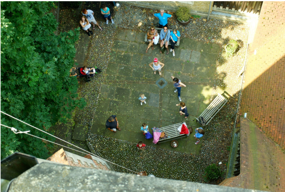
View from the Bell Tower during Teddy Bear Parachuting at Barnes Fair 2014

Please call Rosie Findlater: 8876 5338 or rosemary@pfindlater.plus.com .