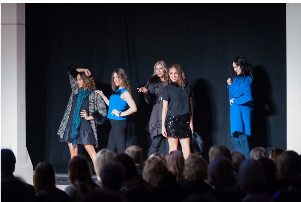
Models show off latest styles at the Barnes Charity Fashion Show 2014