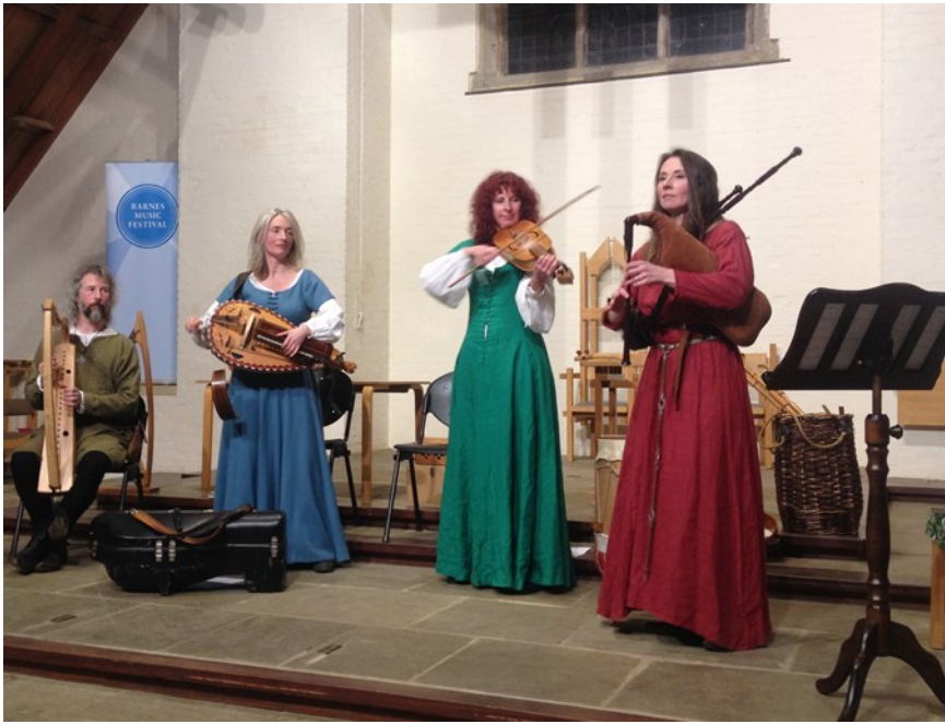
Medieval musicians Misericordia at Barnes Music Festival 2015