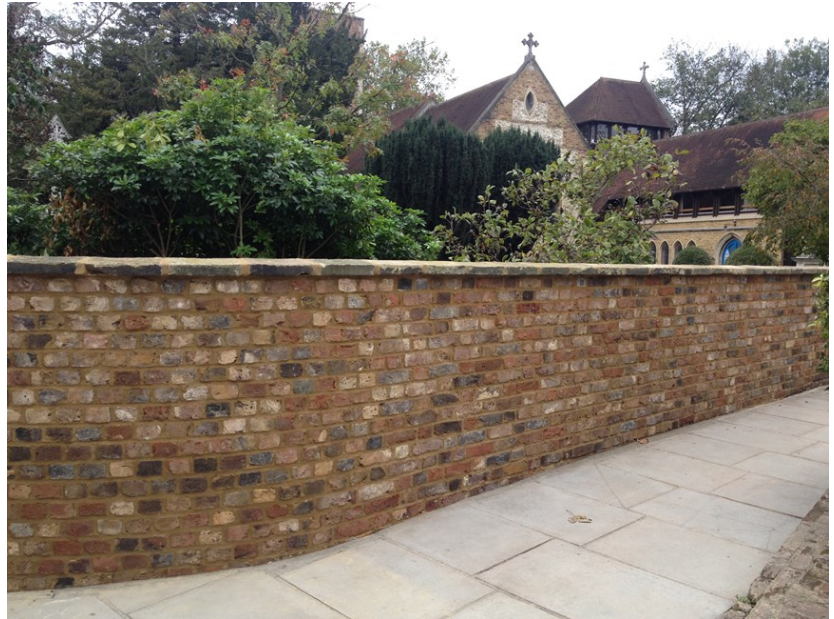
Renovated churchyard wall funded by the Friends of St Mary's