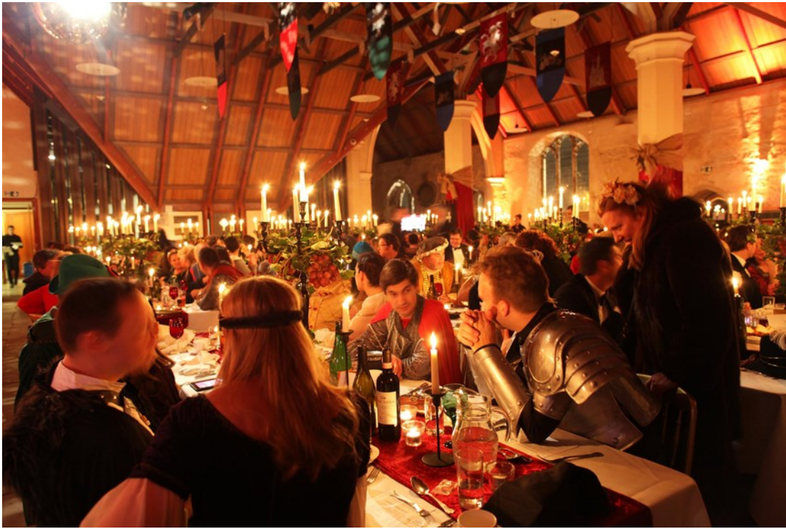
Guests enjoying dinner at the Barnes Charity Ball 2015 The Medieval Ball