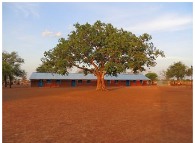
Under Tree Schools in South Sudan

One of the ways to help our charities is via donations. The PCC aims eventually to give away 10% of St Mary's income. The money comes from the Barnes Charity Ball, the Christmas Charity Fair, the Fashion Show and other events (not from the PCC's budget for running costs). And we give some gifts in kind, such as food donated at Harvest Festival, and toys at the Toy Service.